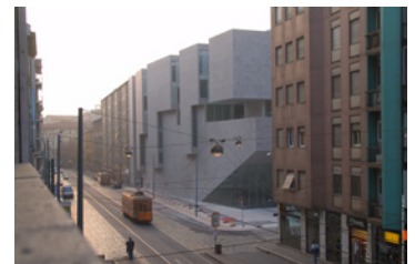
University Luigi Bocconi