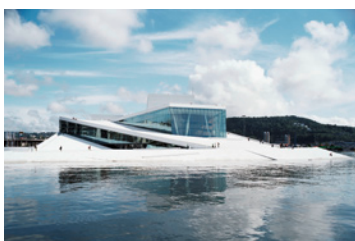
The Norwegian Opera & Ballet