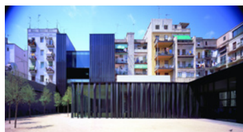
Library, Senior Citizens' Centre and City Block Core Zone, Sant Antoni's District