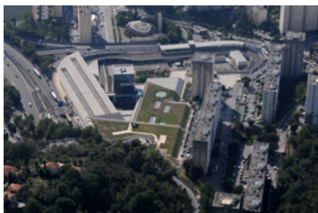
Multimodal Centre – Nice Tramway